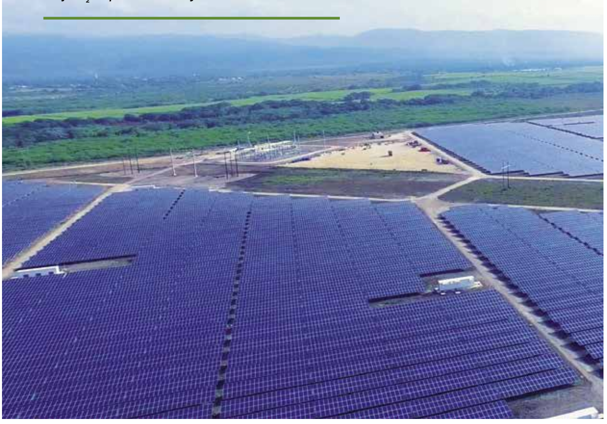
WRB Energy developed the 28 MWp Content Solar site in Clarendon, Jamaica.